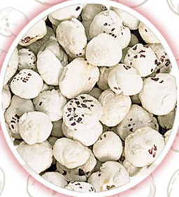
6 Suta Ex