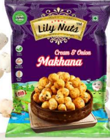
Cream & Onion