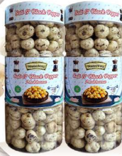
Salt & Pepper